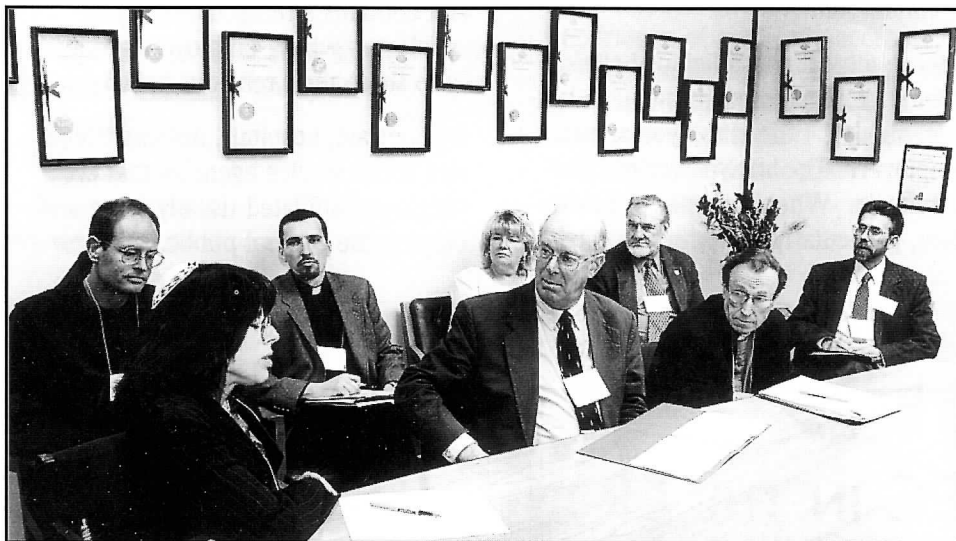
Religious leaders come together for Clergy Day in Albany.